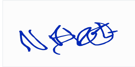
Verified Electronic Signature

Name: Miss Nicole Black Email: nicoleblack25@hotmail.co.uk Telephone: 07393508611 IP Address: 86.139.89.93