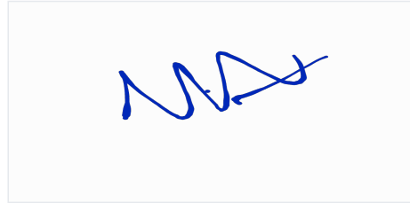
Verified Electronic Signature