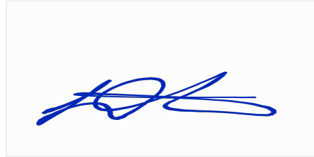
Verified Electronic Signature