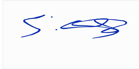
Verified Electronic Signature