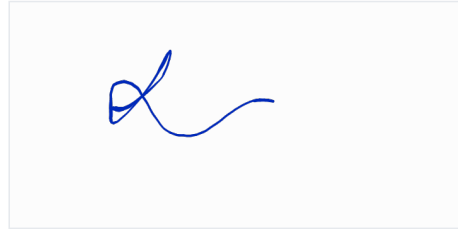
Verified Electronic Signature