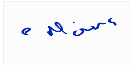
Verified Electronic Signature