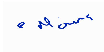
Verified Electronic Signature