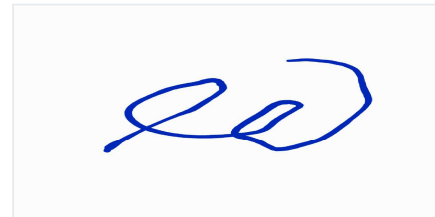
Verified Electronic Signature

Name: Not Provided Email: emmalindsay26@outlook.com Telephone: Not Provided IP Address: 62.56.89.108