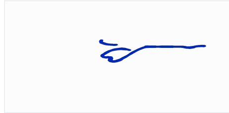
Verified Electronic Signature

Name: Not Provided Email: francesmcgowan69@outlook.com Telephone: Not Provided IP Address: 86.22.112.69