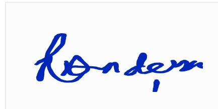
Verified Electronic Signature