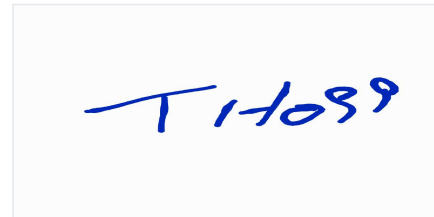
Verified Electronic Signature